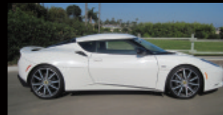
2011 Lotus Evora "S" mileage: 6k