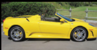
2007 Ferrari F430 Spider F1 mileage: 13k