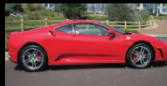
2006 Ferrari F430 Berlinetta F1 mileage: 9k