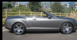
2008 Bentley Continental GTC mileage: 15k