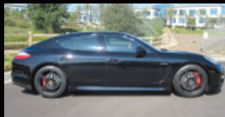
2010 Porsche Panamera Turbo mileage: 13k