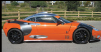
2009 Spyker Laviolette LM85 mileage: demo